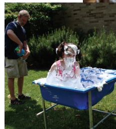
Before and after...